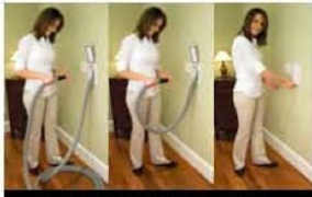
Easily retracts into wall when finished